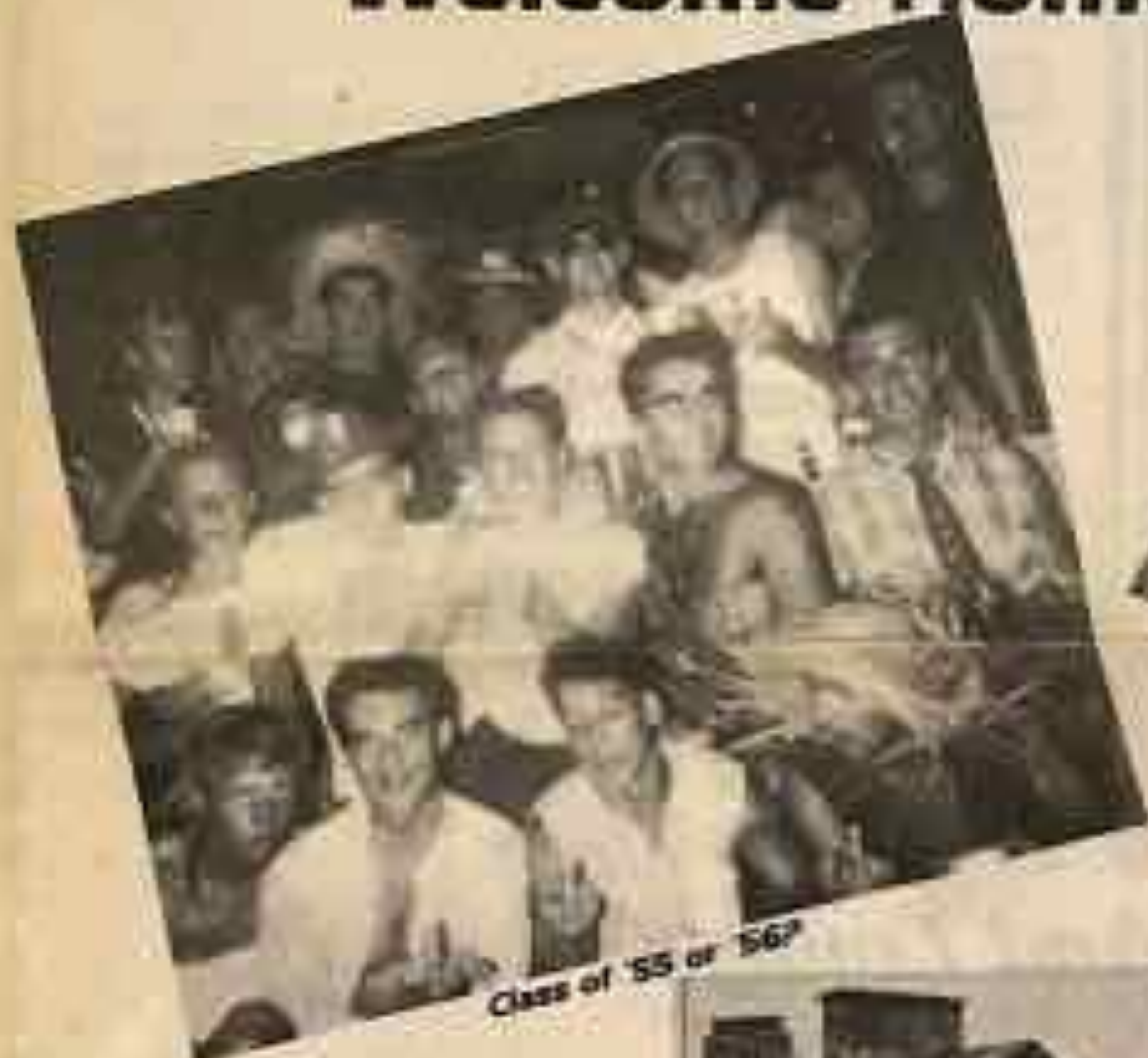
Class of '55 or '56?