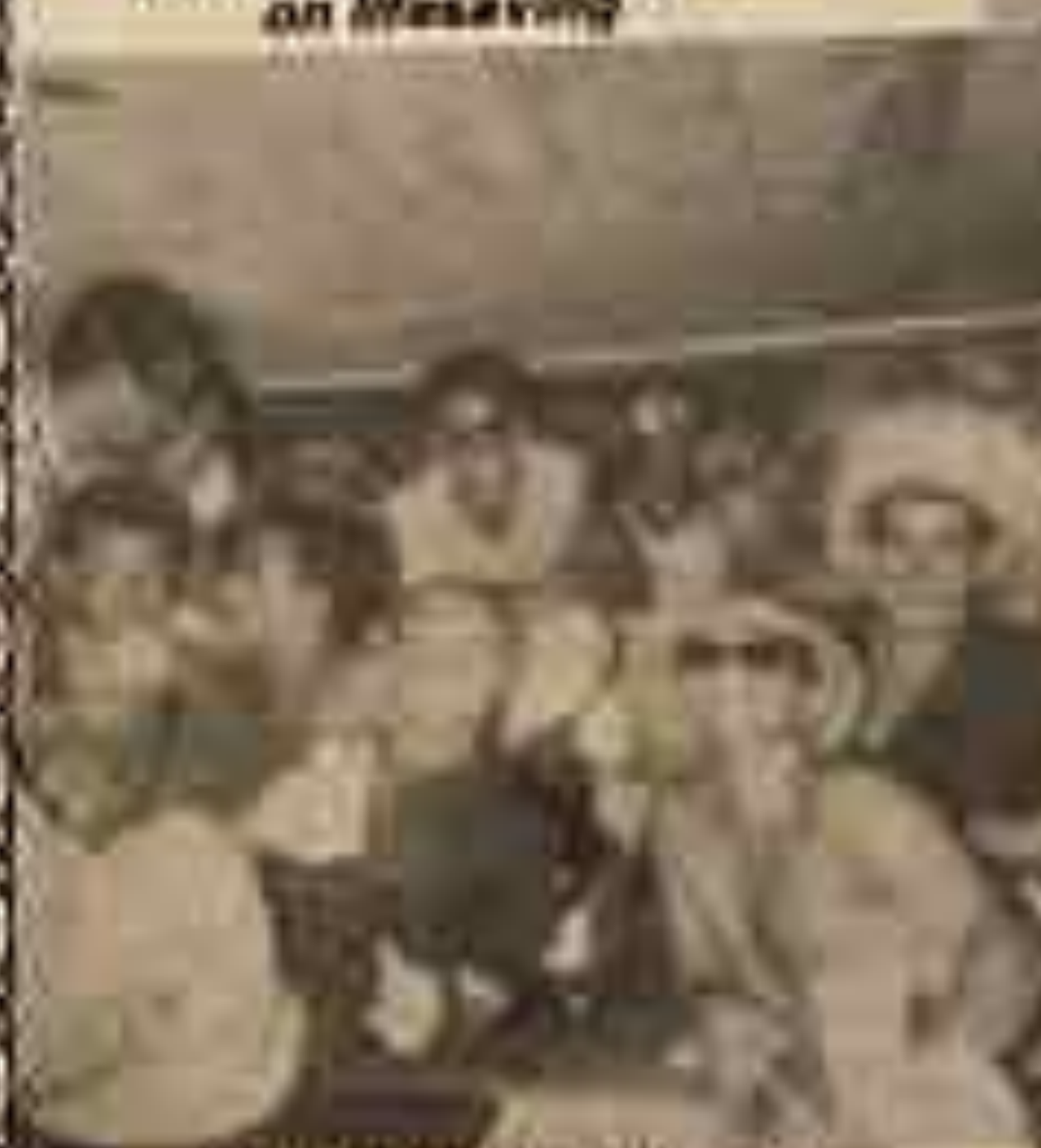
When the Pad was #1