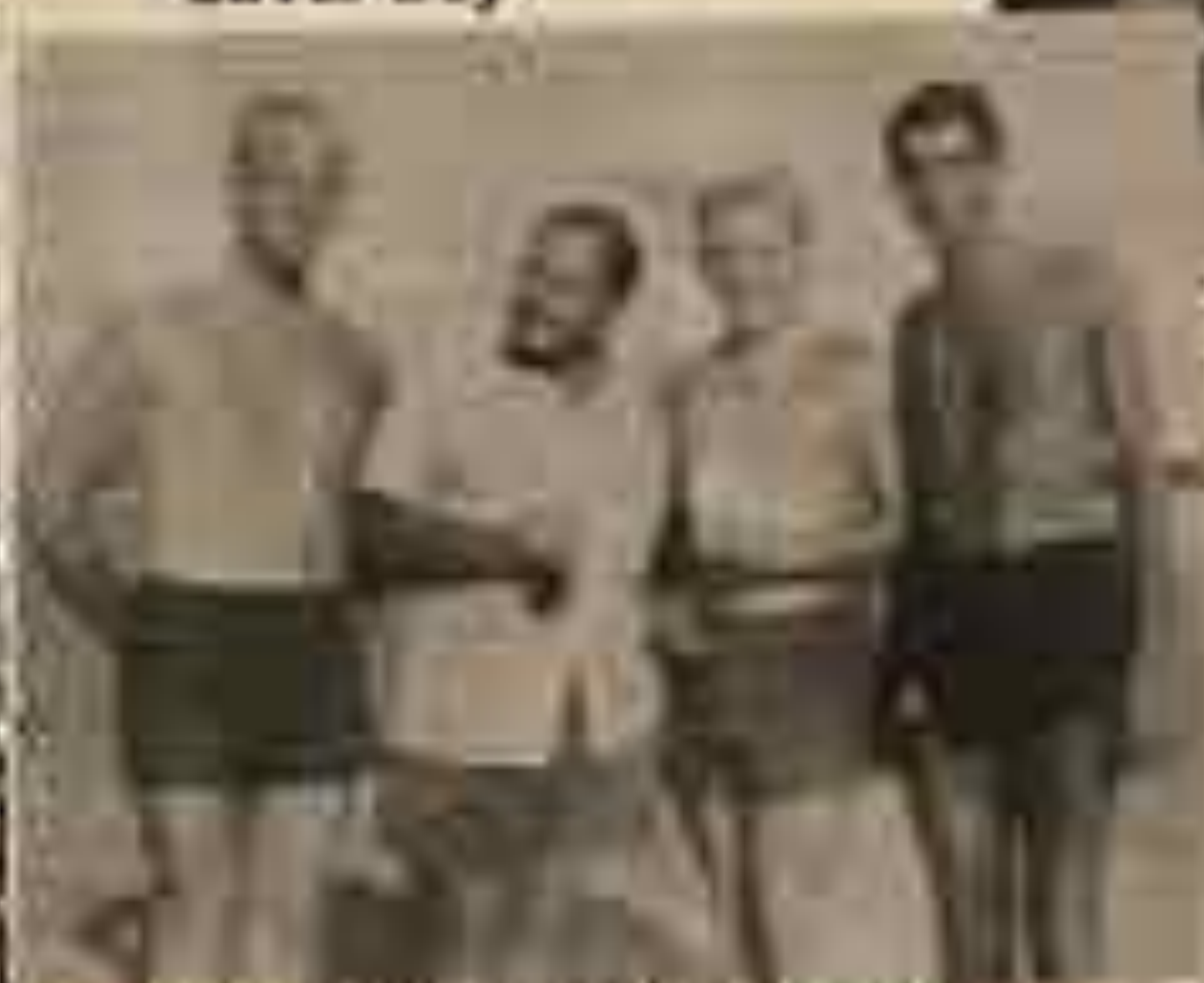
Beaver giving instructions on Mesaving