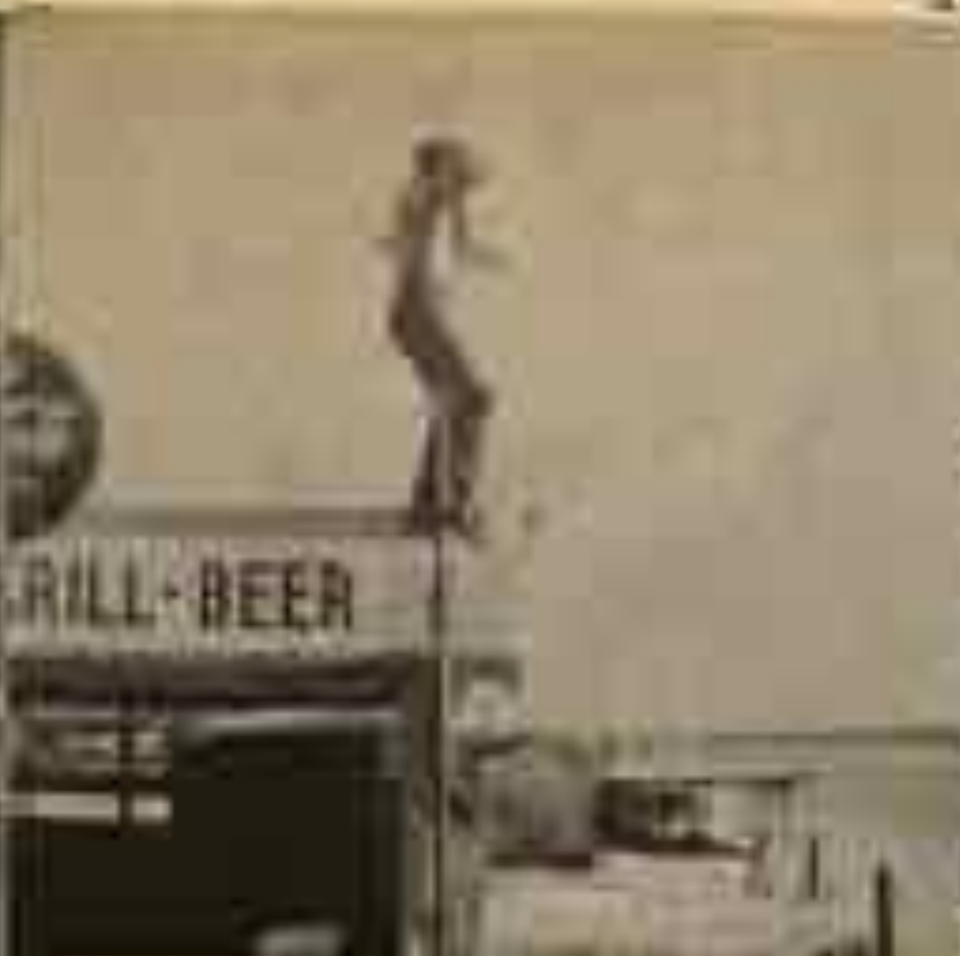
Pavilion dance floor