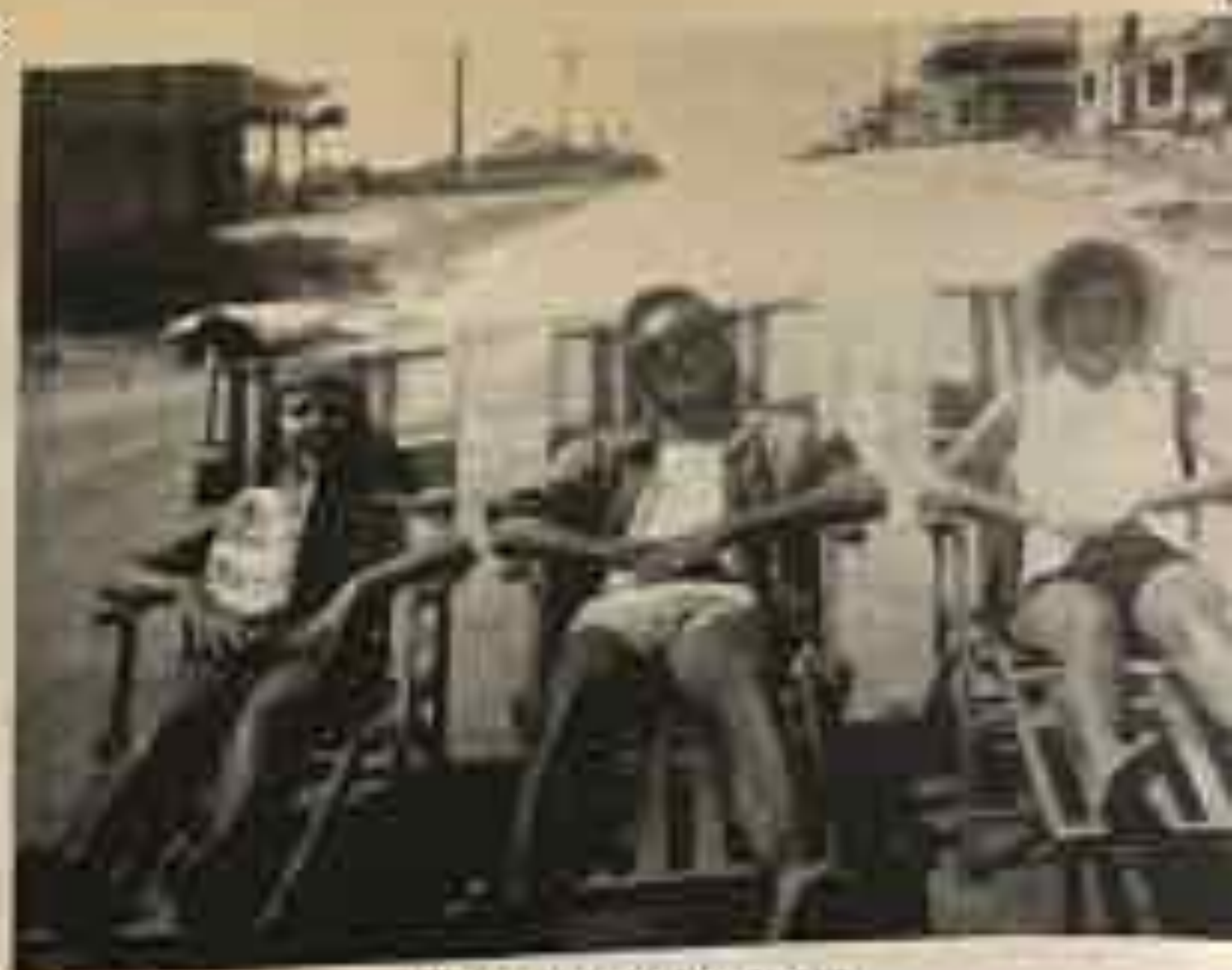
Crescent Beach 1952