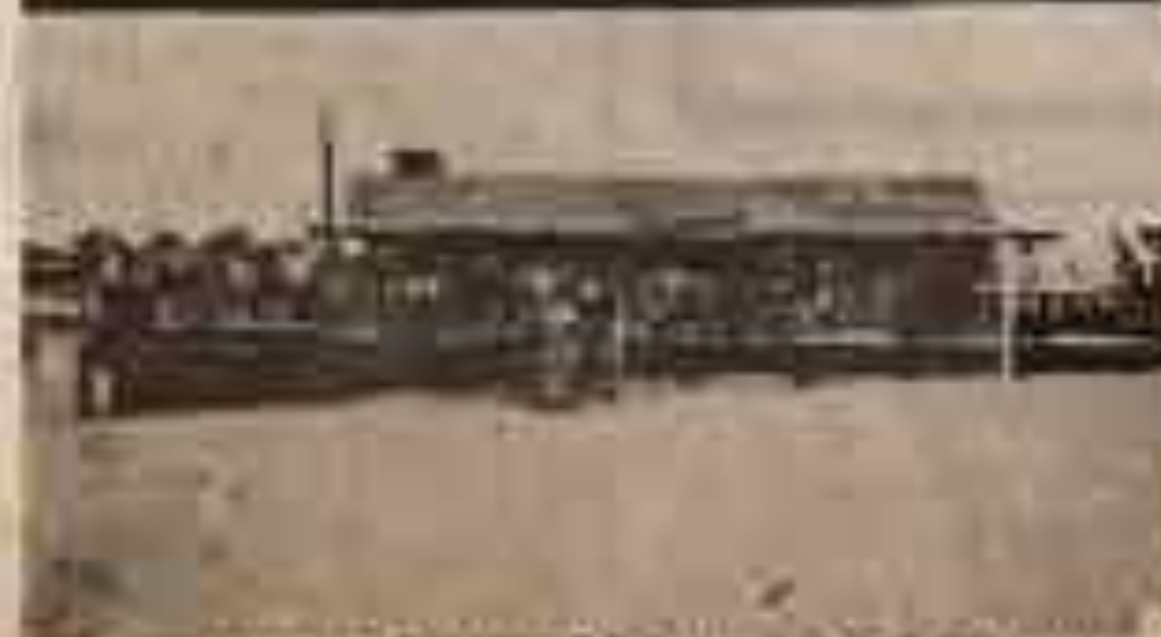
When Fat Harold's was Beach Party