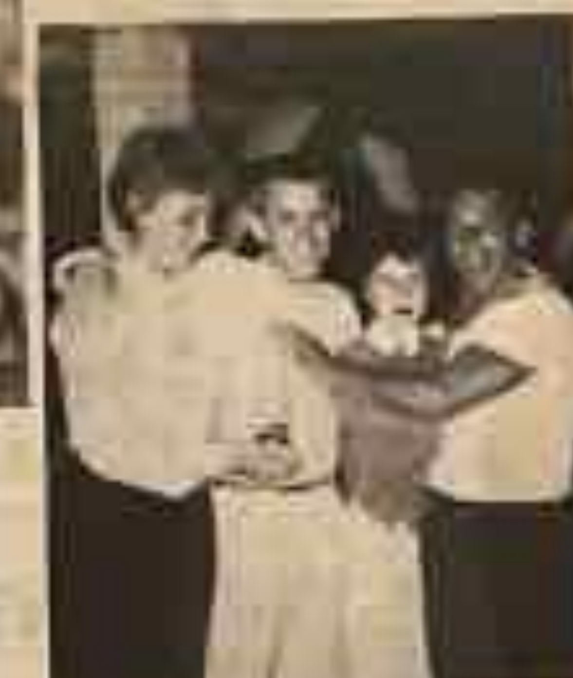
Every night's date night at D.D.