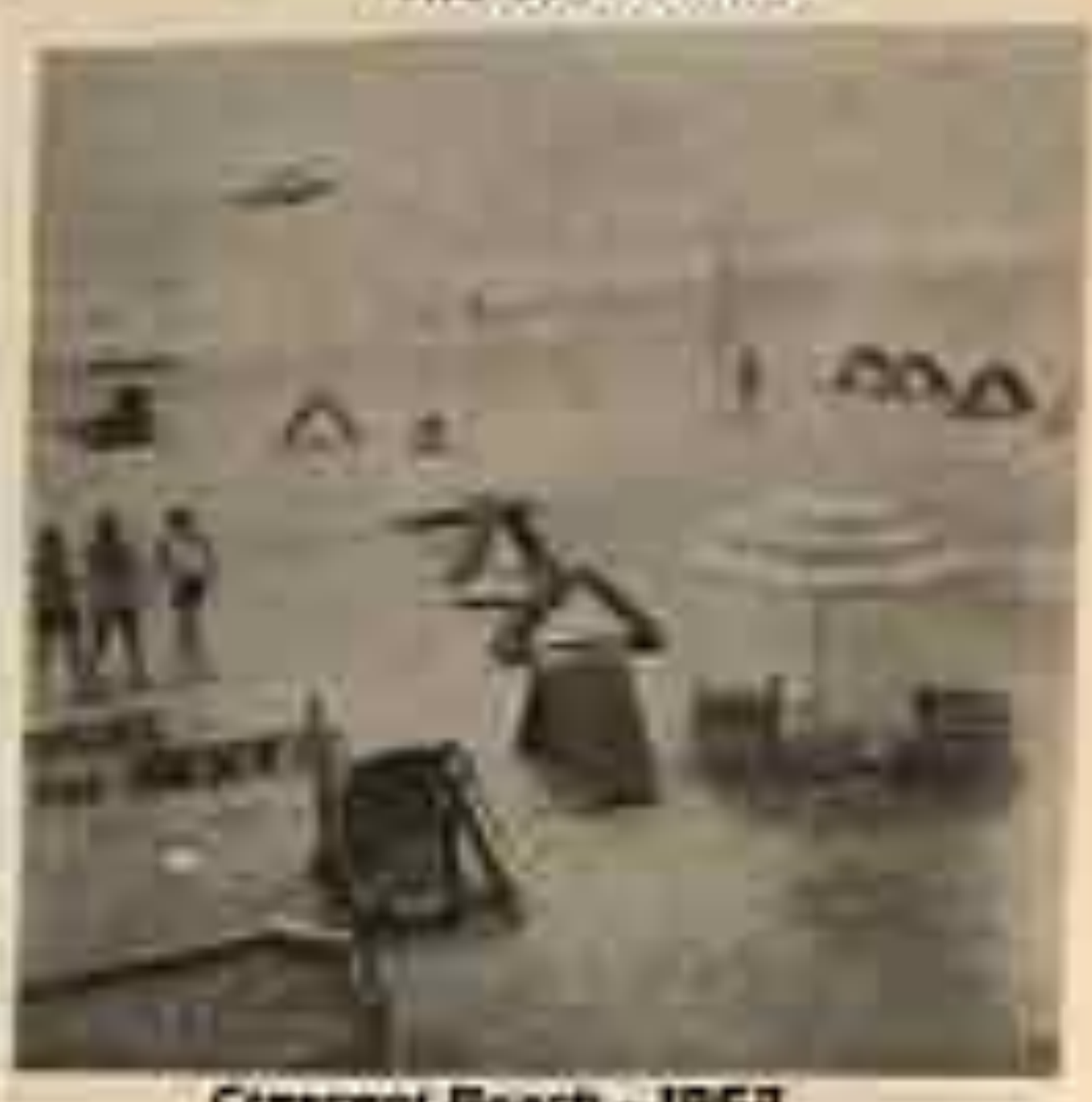
Crescent Beach - 1953

or maybe my 4 year old son from North Myrtle