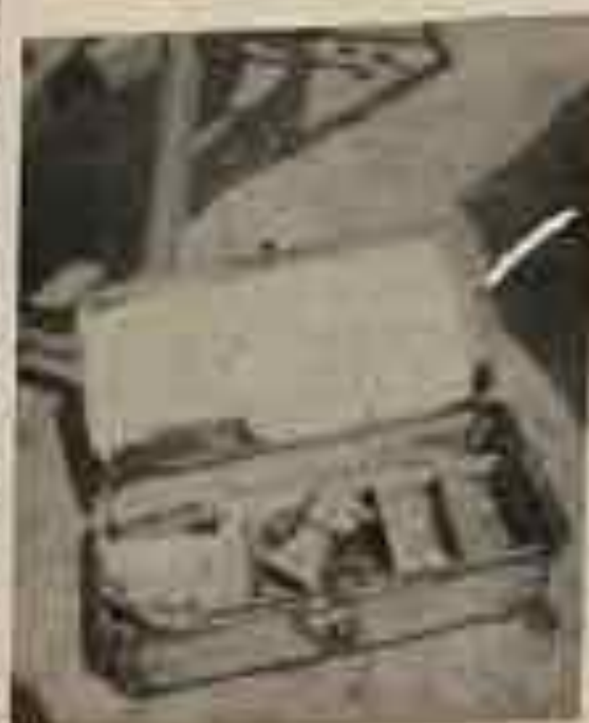
"Deaver Boy's cash box"