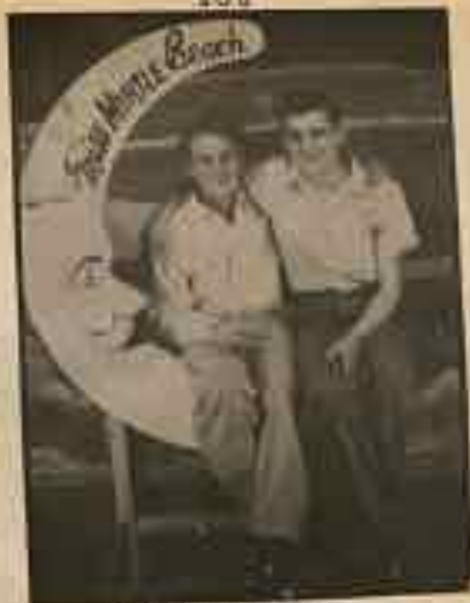
DWAM AND SLEPPY