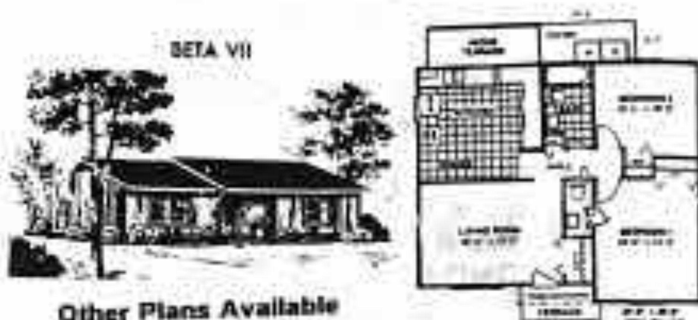
Other Plans Available

Finally! An Affordable Garden Home... Priced from $48,900. Local Financing Available These unique garden homes are located on 3rd Ave. South in the Ocean Drive Section of North Myrtle Beach, just a few blocks from the ocean, parks and shopping areas.