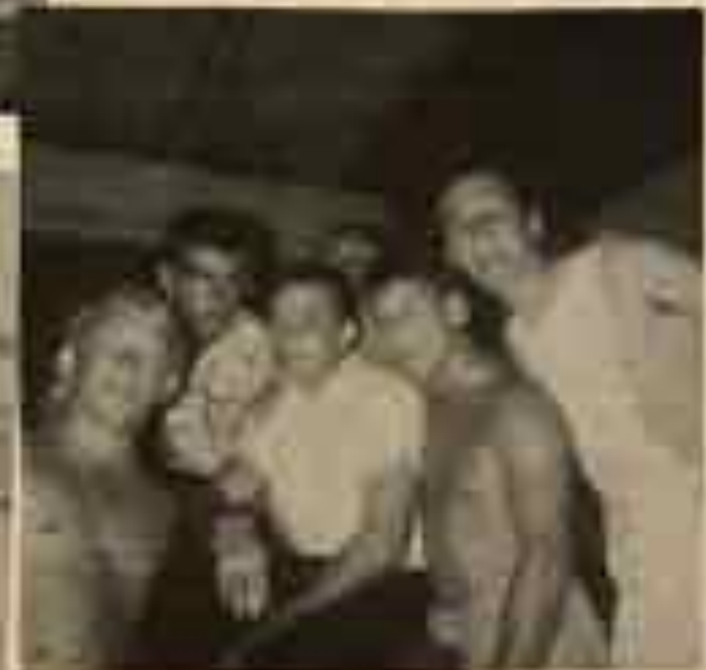
The Wild Bunch