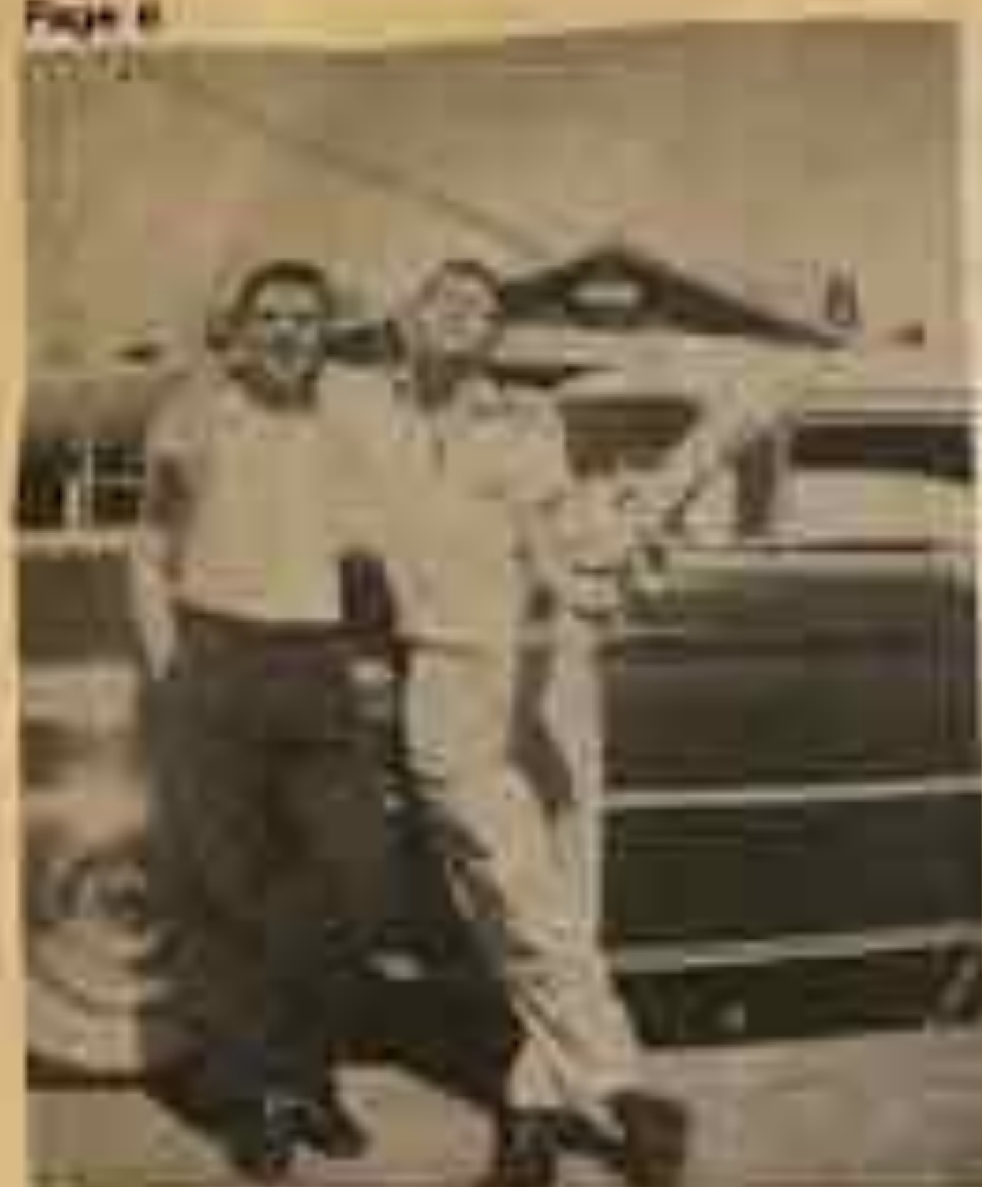
In front of the old Pavilion