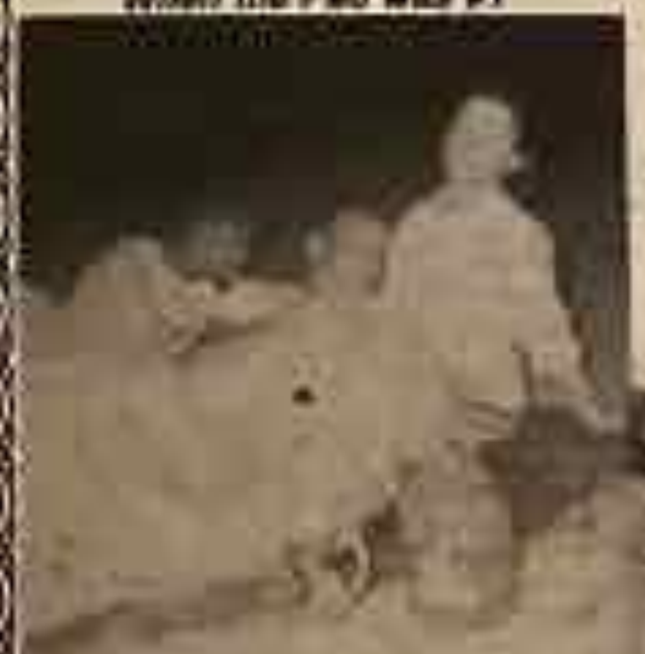
Beach blanket parties