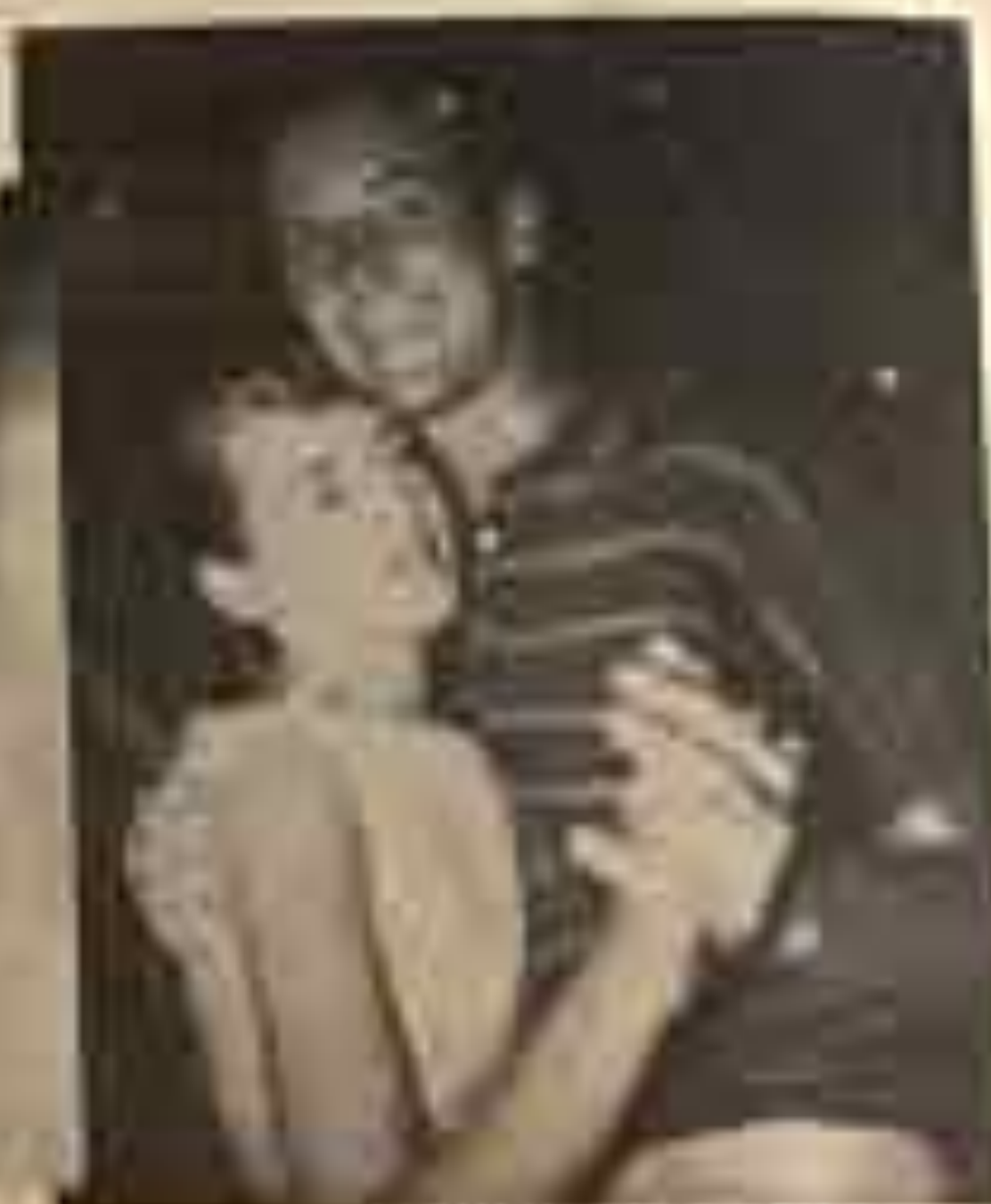
Our man Toby