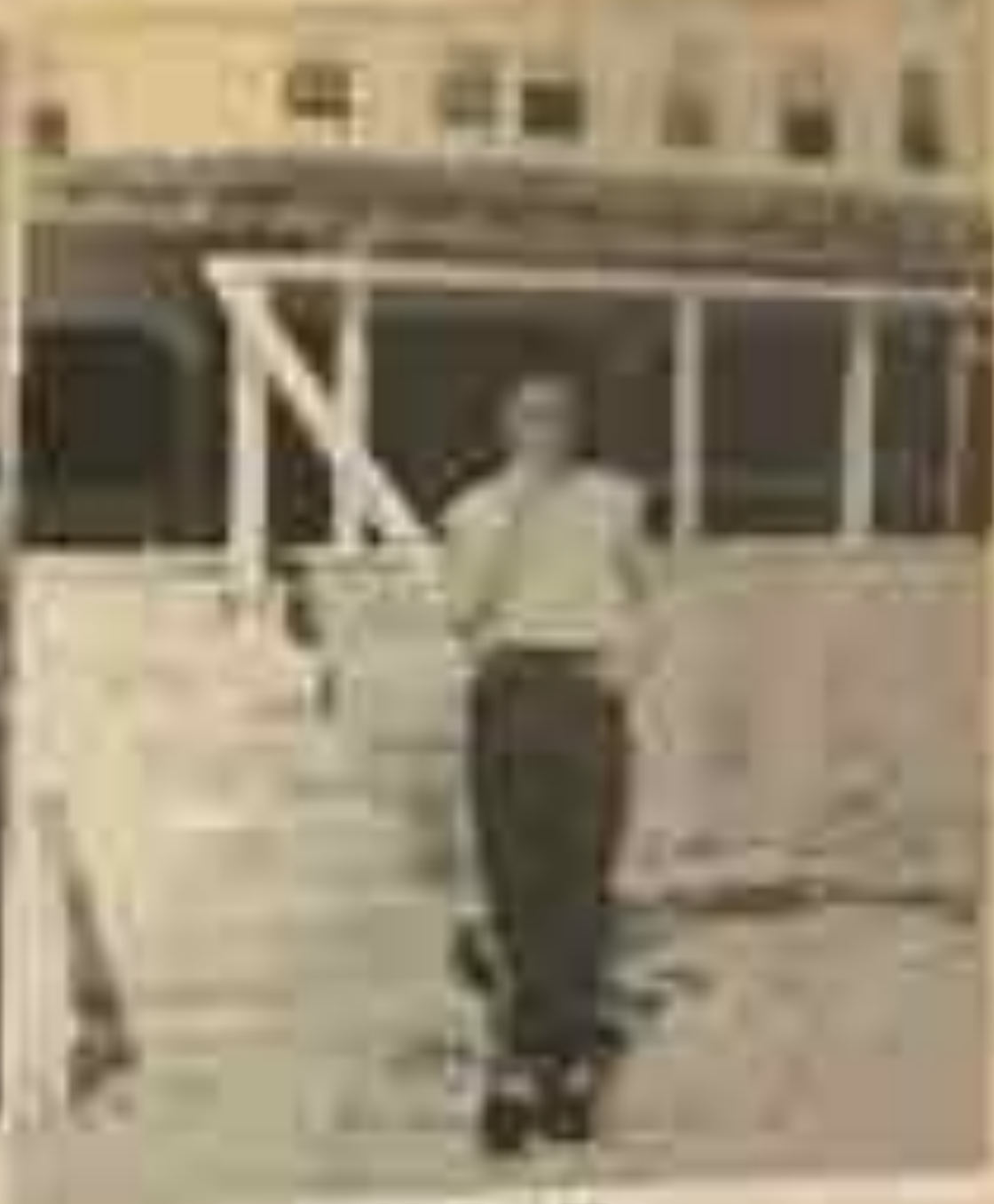
The Old Pavilion