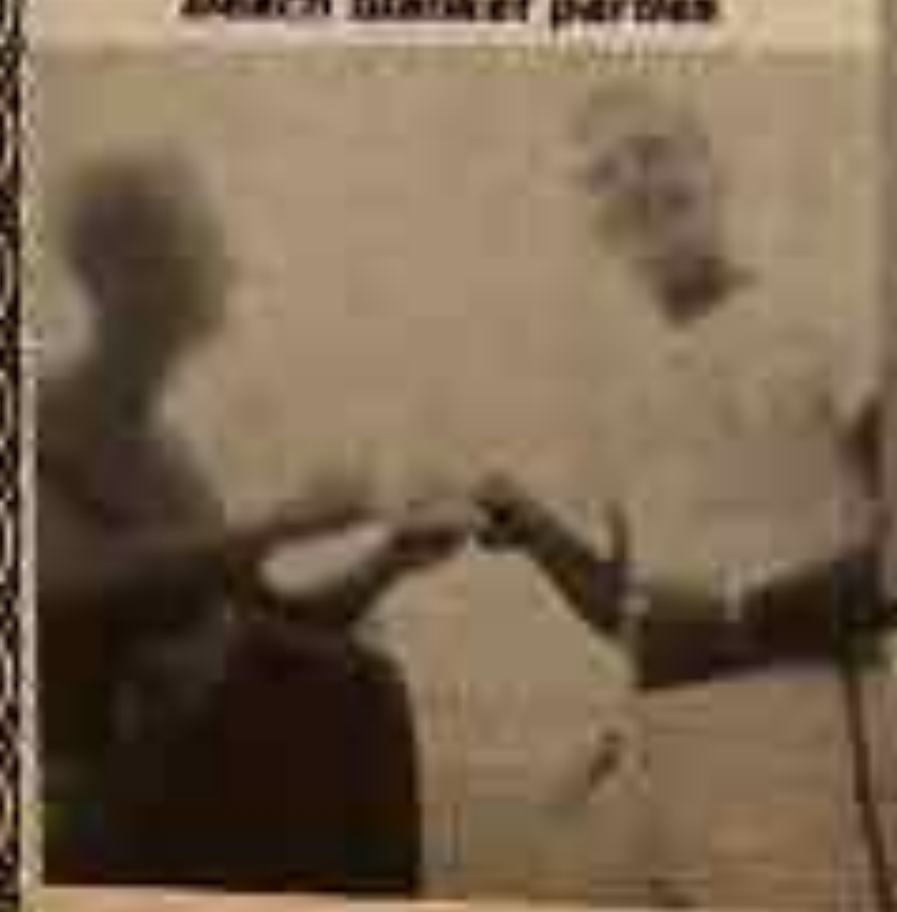
Beaver Boy renting a floor